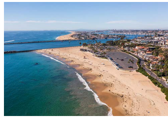
CORONA DEL MAR

Don't miss: Come during the summer and fall to catch the highest surf.