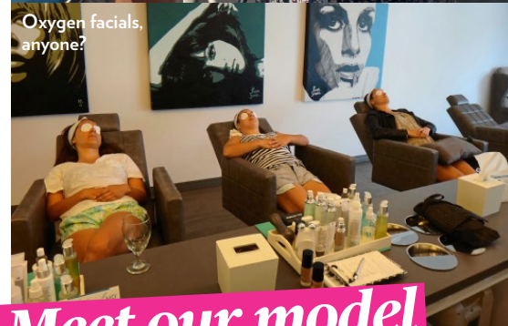
Oxygen facials, anyone?